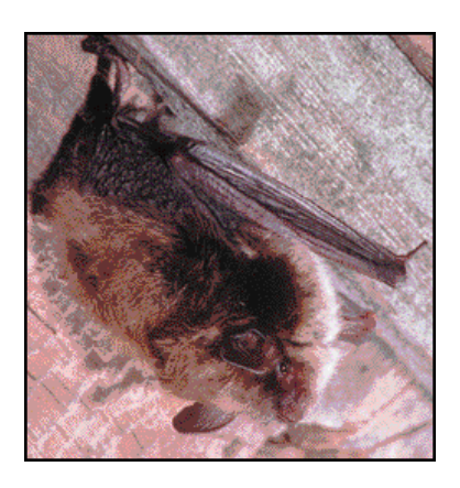
Little Brown Bat (Myotis lucifugus)

Yes. Worldwide, bats are a major predator of night-flying insects, including pests that cost farmers billions of dollars annually. Throughout the tropics, seed dispersal and pollination activities by bats are vital to rain forest survival. In addition, studies of bats have contributed to medical advances including the development of navigational aids for the blind. Unfortunately, many local populations of bats have been destroyed and many species are now endangered.