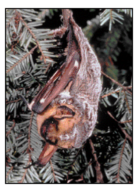
Hoary Bat (Lasiurus cinereus)

Most of the recent human rabies cases in the United States have been caused by rabies virus from bats. Awareness of the facts about bats and rabies can help people protect themselves, their families, and their pets. This information may also help clear up misunderstandings about bats.