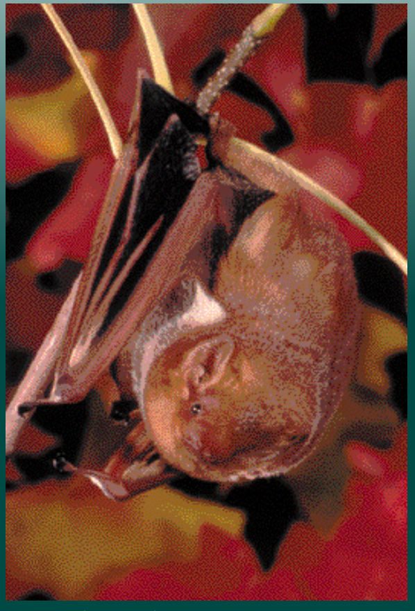
Eastern Red Bat (Lasiurus borealis)