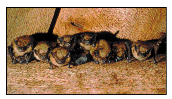
Big Brown Bat (Eptesicus fuscus)

If you see a bat in your home and you are sure no human or pet exposure has occurred, confine the bat to a room by closing all doors and windows leading out of the room except those to the outside. The bat will probably leave soon. If not, it can be caught, as described, and released outdoors away from people and pets.